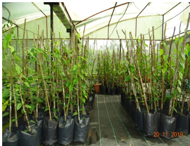
Fig. 2: Regenerated plants of blood fruit ready for planting

Value followed by similar alphabet in a row do not differ significantly using least significant differences at 5% level of significance