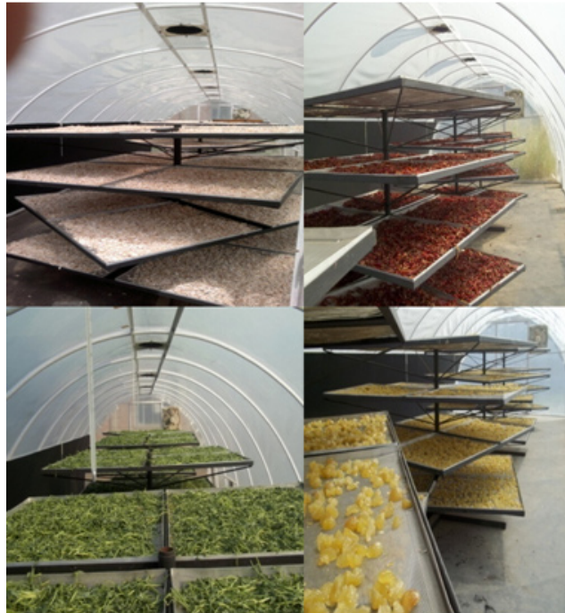
Fig. 1: Solar tunnel dryer at full load conditions when loaded with garlic, chilli, fenugreek and aonla candy