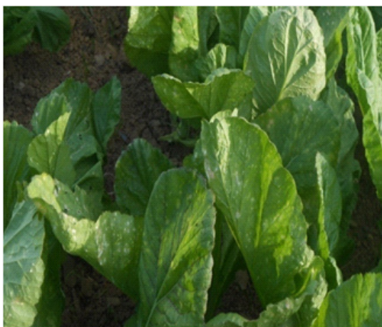
Fig. 1: White rust infection on Lamtachabi (V 2 )

After the incubation period the growth of fungi was studied under microscope. By comparing the