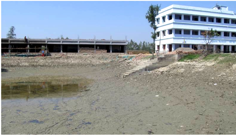
Fig. 2: Roof top rain water harvesting and Pond water conservation

This roof top rain water conservation during monsoon would play dual roles namely i) will help to minimize the wastage of rainwater through surface run-off and ii) would be useful during non-monsoon periods especially for domestic, drinking