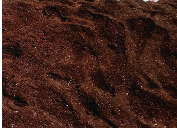
Fig. 1: Finished Biocompost produce from the floral waste