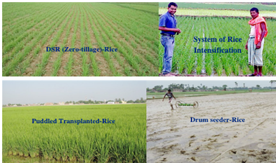
Fig.1: Different crop establishment techniques of rice ( Oryza sativa L.)

of soil and wastage of time. The conventional rice planting method is transplanting which involves seedling preparation in nurseries and replanting in puddled soils (Chen). 4 Puddling is a common process by which cultivating soil in 2.5 to 5.0 cm standing water and finally bed prepared for transplanting (Bouman and Tuong). 3 In most of the Asian countries transplanting is widely practiced (Mabbayad and Obordo). 15 The benefit of the conventional puddled rice increased nutrient availability in soil basically iron, zinc and phosphorous and also reduce the weed population (Surendra). 21 The puddled soil create anaerobic conditions to increase nutrient availability (Sanchez). 20