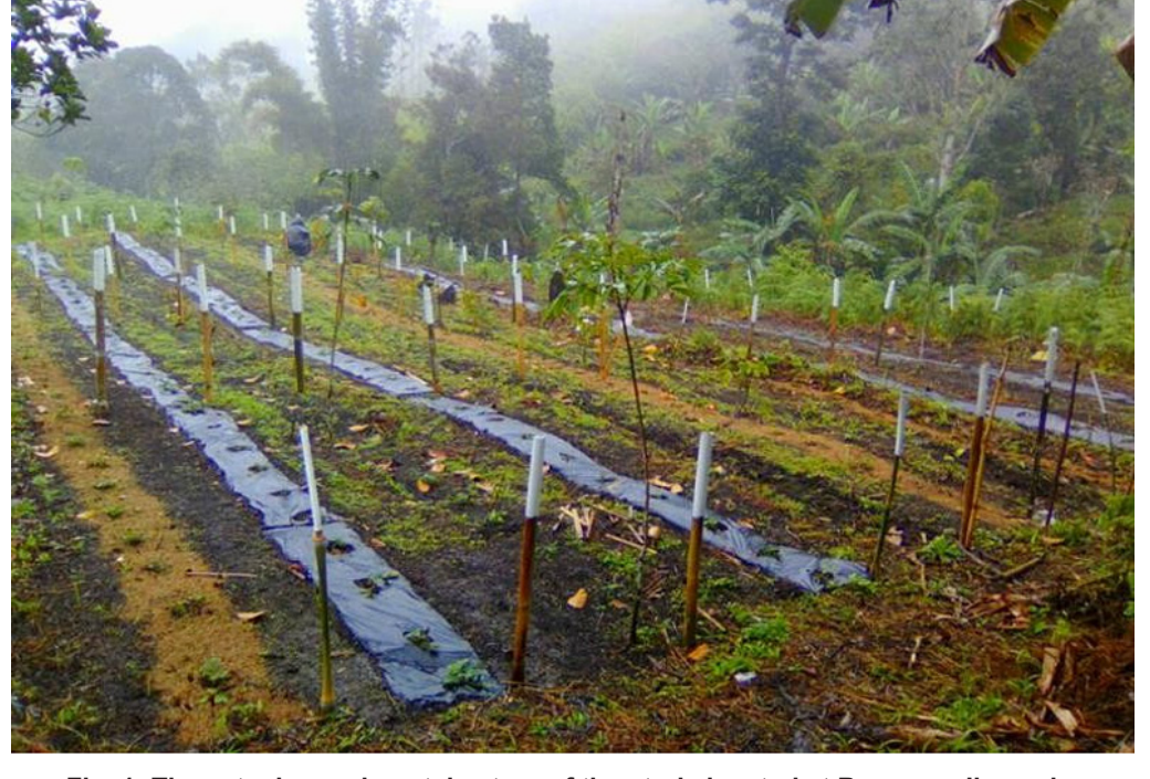
Fig. 1: The actual experimental set-up of the study located at Barangay llomavis, Kidapawan City, North Cotabato, Philippines.

The growth and yield performance of strawberries using different mulching materials were investigated (Figure 1). Application of mulching materials were done three days before planting the strawberry runners. Ten sample plants/ plot with a total size of 0.5 \times 3 m were used in data gathering. The following mulching materials used in the experiment are the following (without mulching (control), plastic mulch, and rice hulls).