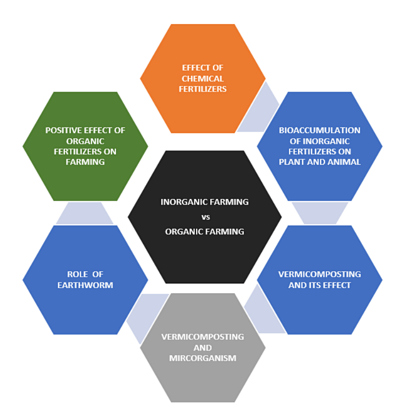
Fig. 1: Effect of Organic and Inorganic Fertilizers on Enviroment